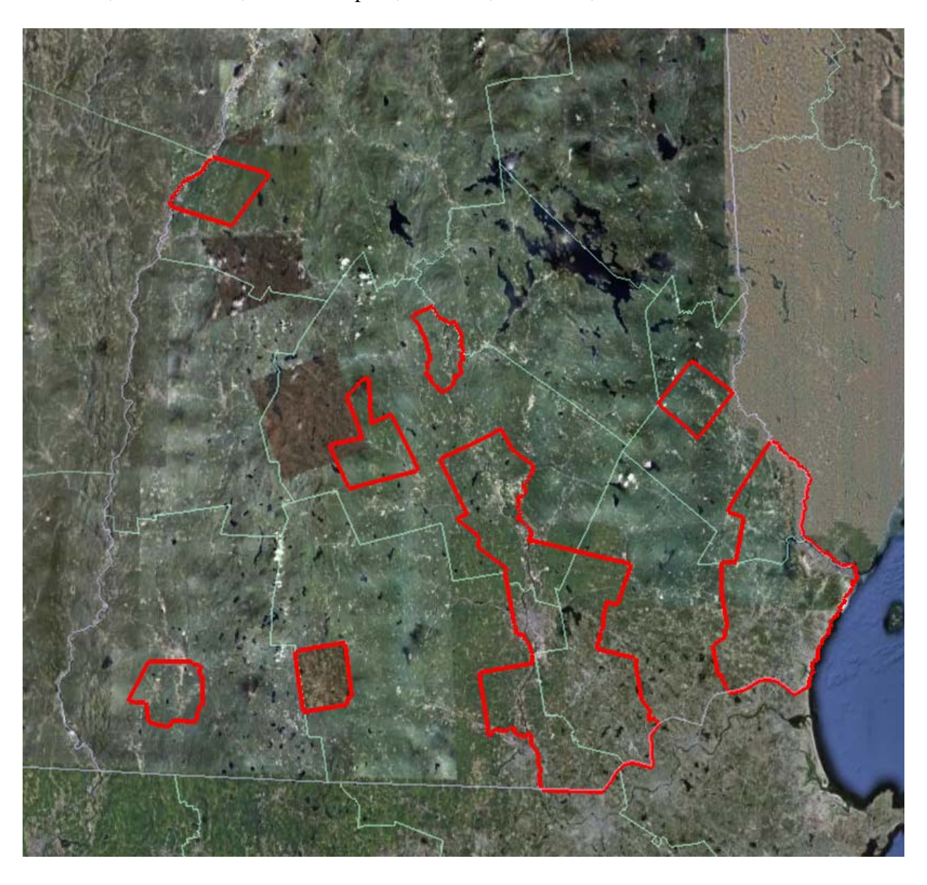
END "ATTACHMENT A"

The coverage of the 0.15 upgrade area shall be the towns of: *Farmington; *Franklin; *Hanover; *Peterborough; *Swanzey; *Warner; Auburn; Bow; Candia; Concord; Derry; Dover; Durham; East Kingston; Exeter; Greenland; Hampton; Hampton Falls; Hooksett; Hudson; Kensington; Litchfield; Londonderry; Madbury; Manchester; Merrimack; New Castle; Newfields; Newington; Newmarket; North Hampton; Pelham; Portsmouth; Rollinsford; Rye; Salem; Seabrook; Somersworth; South Hampton; Stratham; Windham;