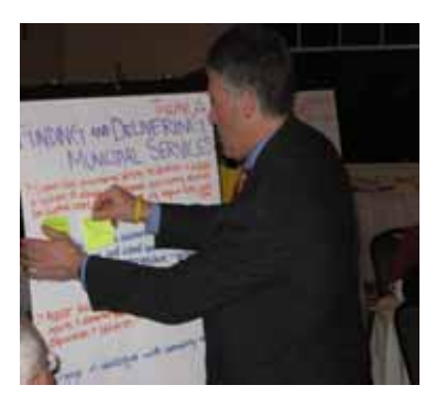
Brainstorming at the February 1<sup>st</sup> CTAP Community meeting.

"The meetings feel very collaborative. I look around and sense a common spirit running through us and that's exciting!" -CTAP Participant