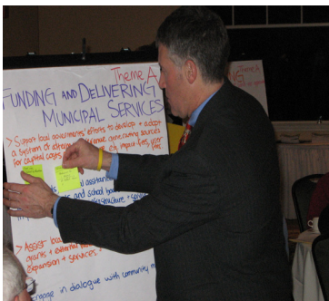
Brainstorming at the February 1 st CTAP Community meeting.

The Steering Committee will also explore new ways of leveraging CTAP’s resources and partnering with other communities interested in transportation and land use management.